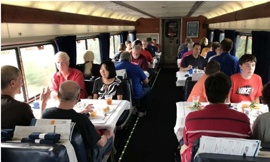
Above, our group enjoys dinner in the diner.