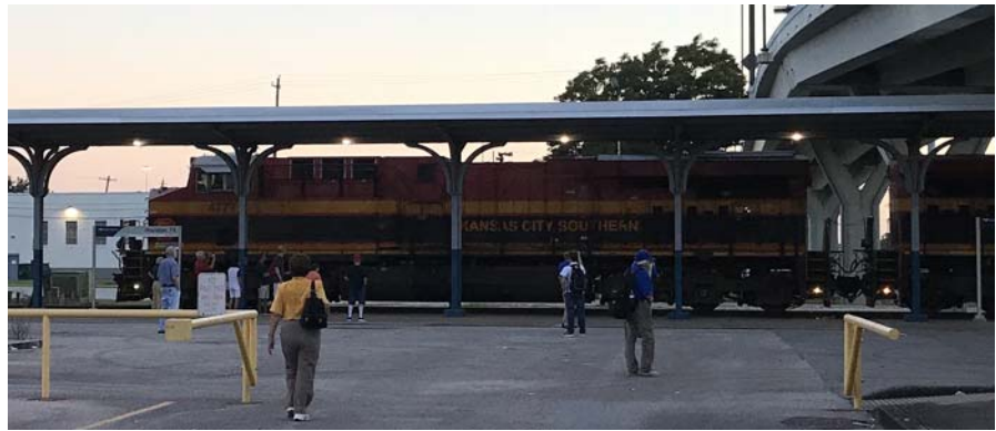
Above, a KCS train rumbles through Houston's Amtrak station just prior to our group's early morning departure by bus for Lake Charles.

N'Crowd members joined friends from Gulf Coast Chapter - NRHS for an entertaining road and rail excursion to Lake Charles, La., on Oct. 6. Our day trip included a motor coach ride to Lake Charles, a tour of the USS Orleck Naval Museum, lunch at the Golden Nugget Lake Charles (with a few trying their luck in the casino), and a ride back to Houston on Amtrak Train No. 1, the Sunset Limited .