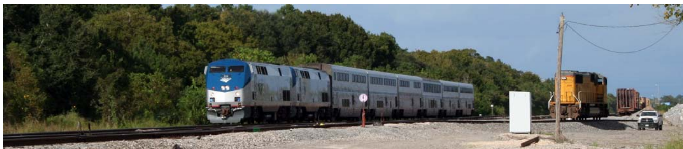
“Our” train rolls through Dayton on its way to Houston on Oct. 6, 2018.