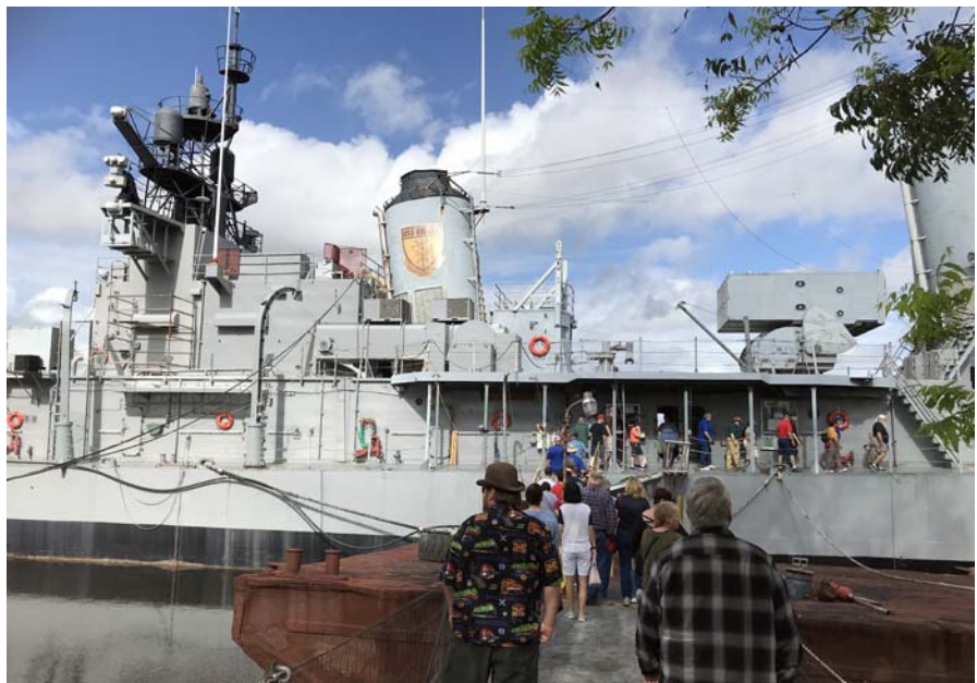
Below left, according to museum staff, Elvis regularly patrols the waters around the destroyer. Below right, a 1946 Railway Express Agency shipping tag is part of a display on the USS Orleck.

On board the train, Amtrak arranged a special early seating for us in the dining car for dinner before arrival in Houston. The train ran close to schedule, arriving in Lake Charles 11 minutes late and at Houston 22 minutes late. The Sunset would have been on time in Houston, but Union Pacific dispatchers sent the train the long way around to the station via Belt Junction rather than the direct route through Englewood Yard.