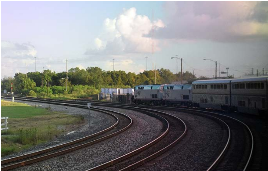
Above, our train approaches Tower 26 near downtown Houston. Below, the Sunset Limited after arrival in Houston.