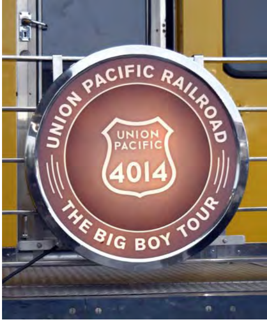
Staci Stalarow focused on the other end of the train at Houston. The lighted drumhead classes up an already class act.