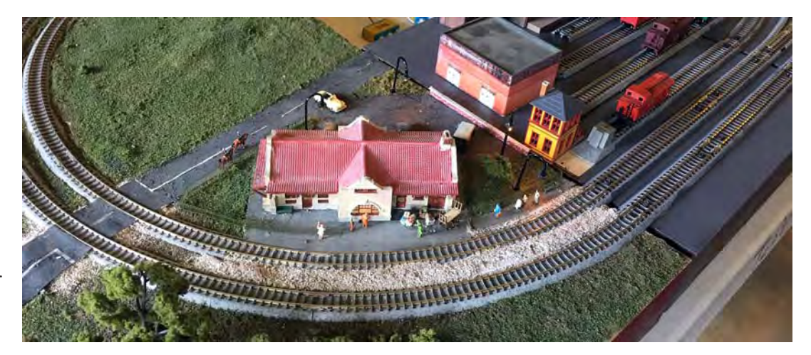
An effective scenic treatment for a T-TRAK end cap module.

TRAK layouts. AustNTrak is a long-established Nscale club with members from the Austin area and other parts of Texas, and it's always an inspiration to see their handiwork.