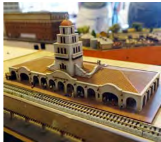
Nicely done models of the mission style Santa Fe station at Albuquerque, N.M., and the modern T&P station at Shreveport, La.