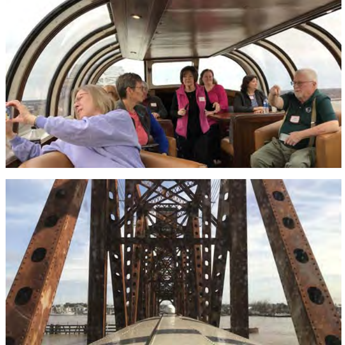
Top, dome lounging means seats with a view. Bottom, crossing the Atchafalaya River.

sleeping car Evelyn Henry . The cars were carried on the rear of Amtrak's Train No. 1, the Sunset Limited . The train departed New Orleans on time at 9:00 a.m., but despite running at speeds of up to 79 mph during the course of the day, arrival in Houston at 7:54 p.m. was a little off the advertised 6:18 p.m. However, no one was complaining as this gave the group more time to enjoy the journey!