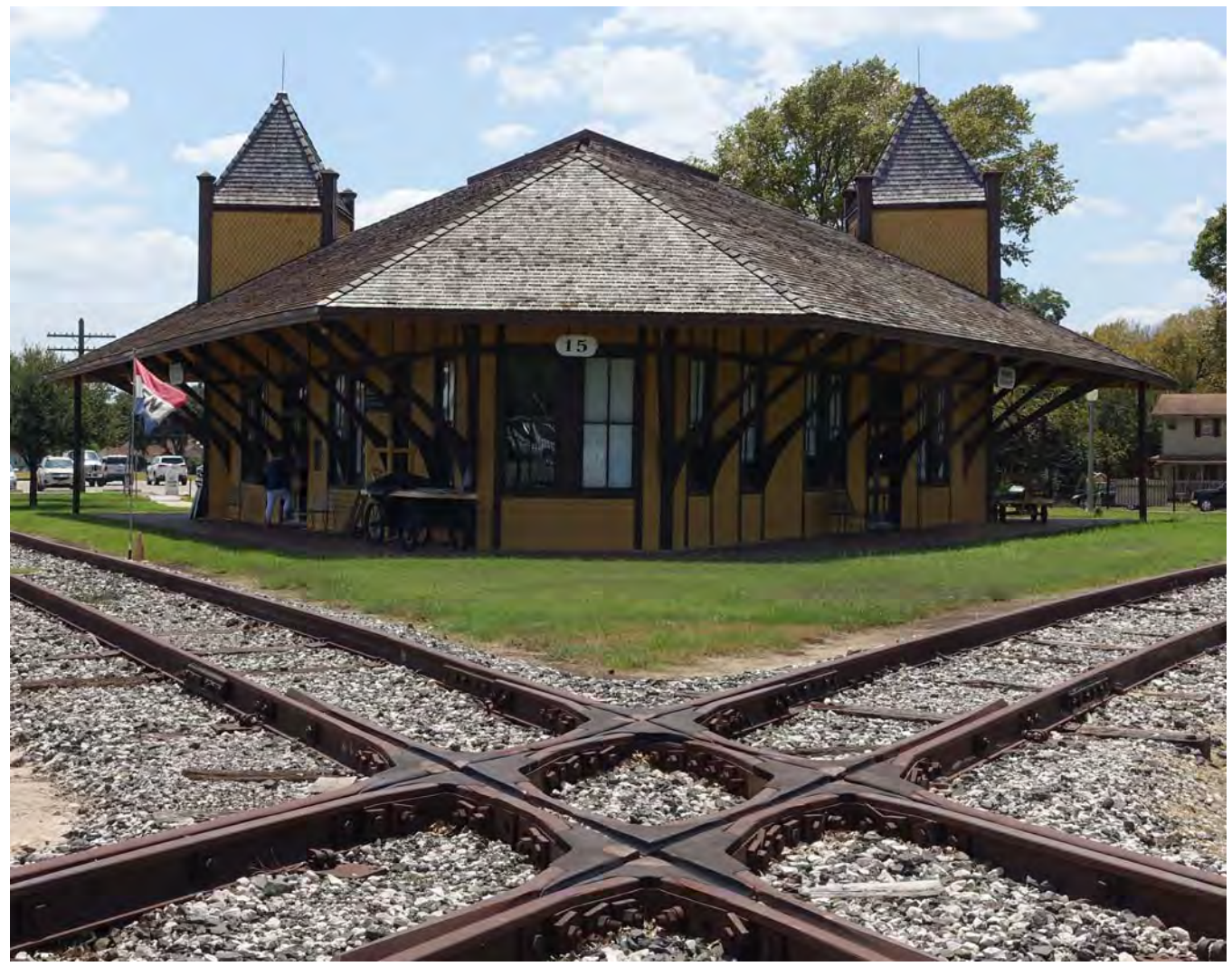
The restored Hearne Depot, relocated a long block away from its original location, was built in 1901 by Southern Pacific. It served as a "Union Station" for SP and Missouri Pacific subsidiary International-Great Northern.

Houston N'Crowd members visited the Hearne Depot Museum on a hot August 18th for "Trains at the Crossroads". In addition to the museum's usual displays, the AustNTrak group set up NTRAK and T-