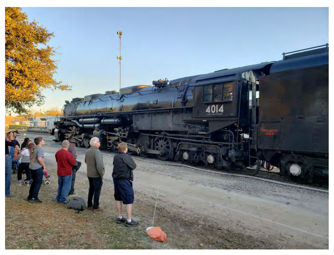
Star of the show wherever it goes! Bob Folser captured the Big Boy among some of its many admirers at Spring (above) and Palestine (below). Thousands turned out trackside as the big engine made its way across Texas.