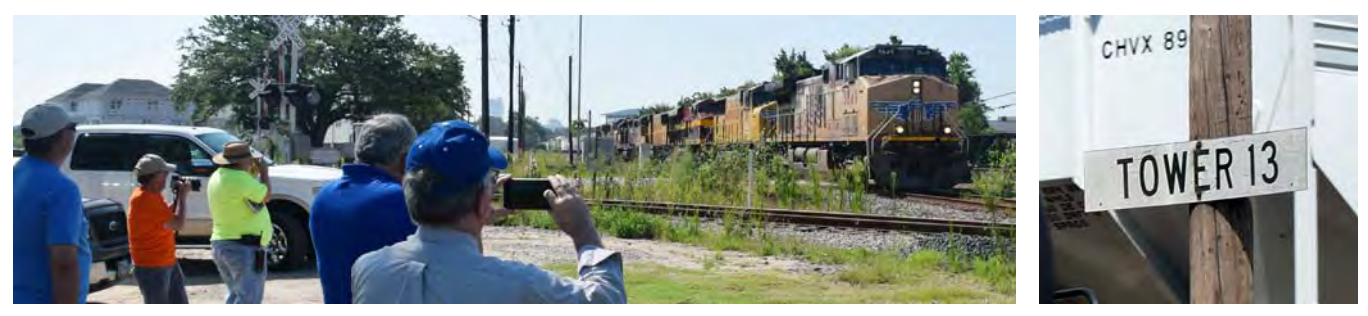
Top two: Seven locomotives power a manifest freight past the location of Tower 13. Today the tower is marked only by a simple signboard.

Right: Warbonnets live! The group spotted saw two warweary GE C44-9W locos working different trains in the iconic - if faded - paint scheme of BNSF predecessor Santa Fe. The locomotives were delivered in 1994, Santa Fe's merger with BN took place in 1996, yet these two sport what looks to be their original paint in 2019.