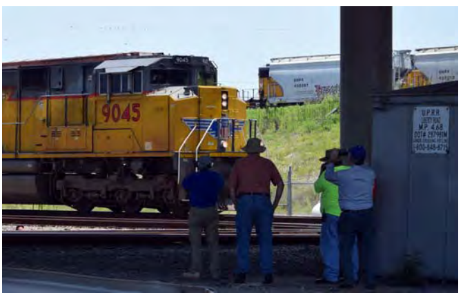
Hearne Museum Visit